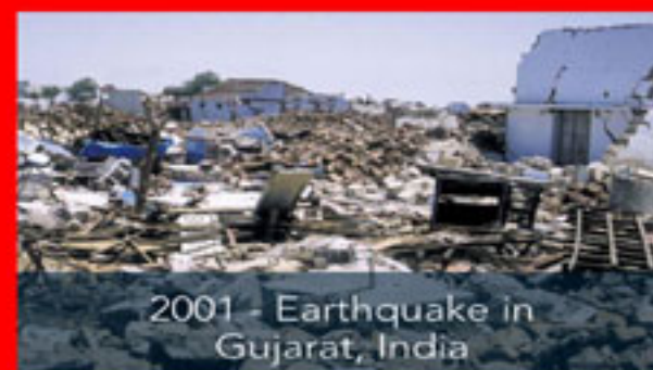
2001 - Earthquake in Gujarat, India